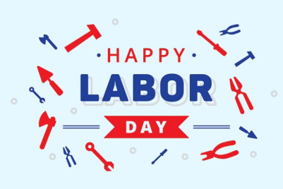
The church office will be closed Monday, September 2nd in observance of Labor Day.